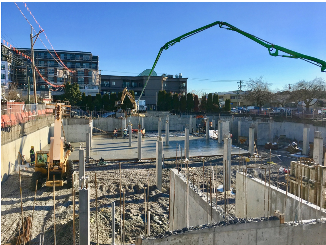
Picture 5: Pouring of Concrete for Parking Floor Slab (December 05 2018)